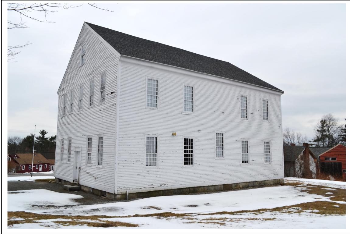
Photo # 4 Description: Webster Meeting House, south (side) and east (rear) elevations. Reference (file name or frame#): DSC0405 Direction: Camera facing northwest.