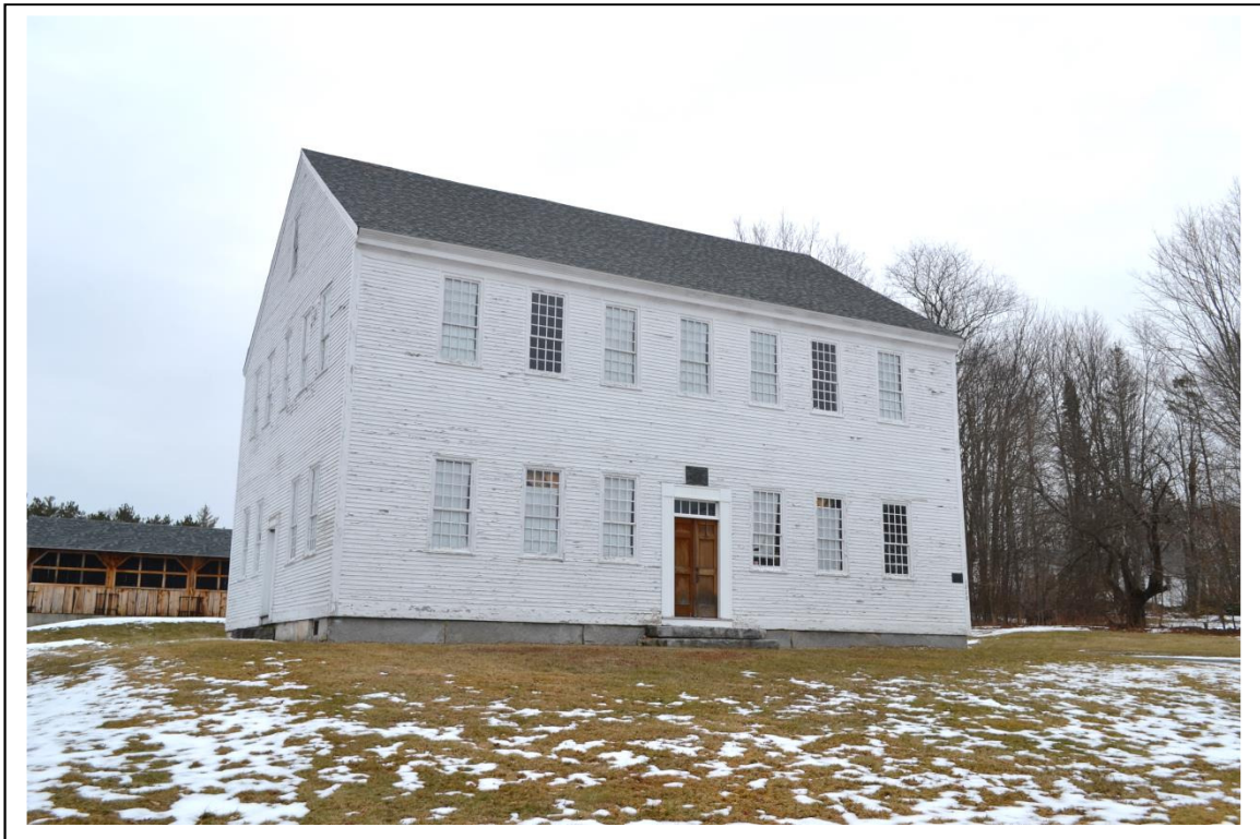
Photo # 3 Description: Webster Meeting House, west (front) and north elevations.

Reference (file name or frame#): DSC0402