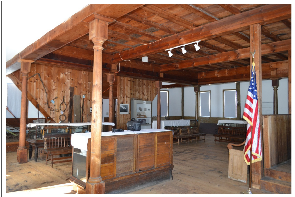
Photo # 7 Description: Town Hall on first story, showing original gallery columns and staircase enclosure.(rear). Reference (file name or frame#): DSC0604 Direction: Camera facing northwest.