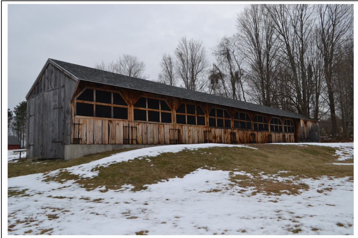
Photo # 5 Description: Horse shed (1972 and 1979), built to display horse-drawn equipment. Reference (file name or frame#): DSC0403 Direction: Camera facing southeast.