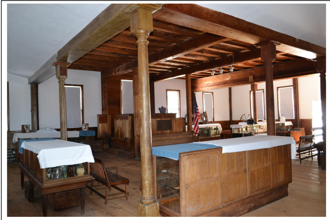
Photo # 6 Description: Town Hall on first story, showing original gallery columns and floored-in opening overhead. Reference (file name or frame#): DSC0614 Direction: Camera facing southeast.