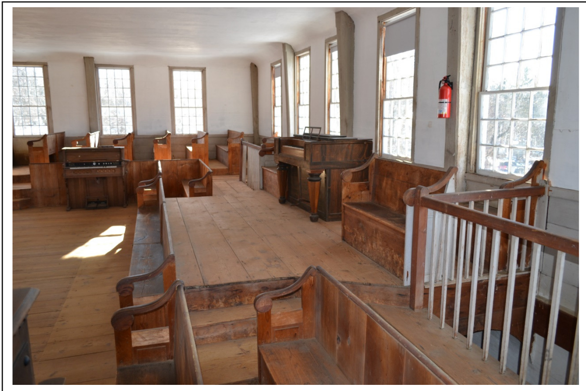
Photo # 9 Description: Second-story chapel, showing elevated platform and seats facing the reading desk.

Reference (file name or frame#): DSC0620