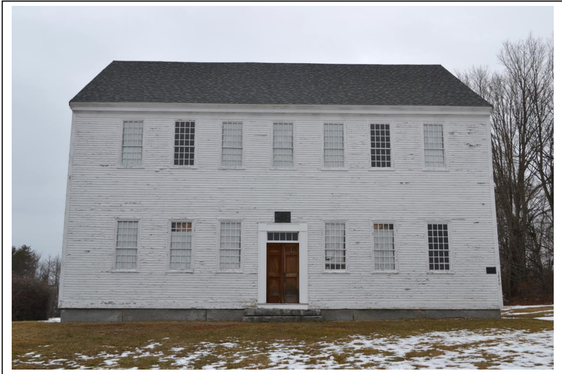
Photo # 2 Description: Façade of the Webster Meeting House. Reference (file name or frame#): DSC0407